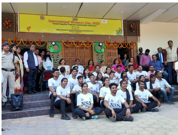
Women's day celebration, NSS, GGV