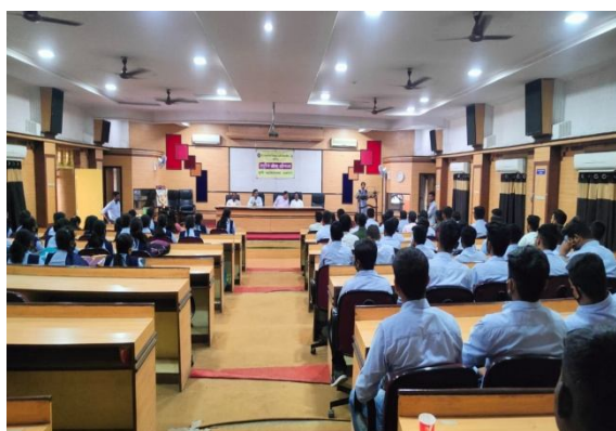
Science Day and Marathi Day celebrated-28/02/2022