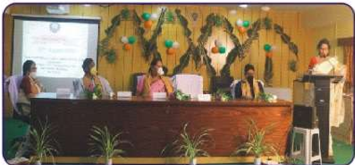
Rabindra-Neerh, the Seminar Hall of Raja N.L. Khan Women's College (Autonomous)