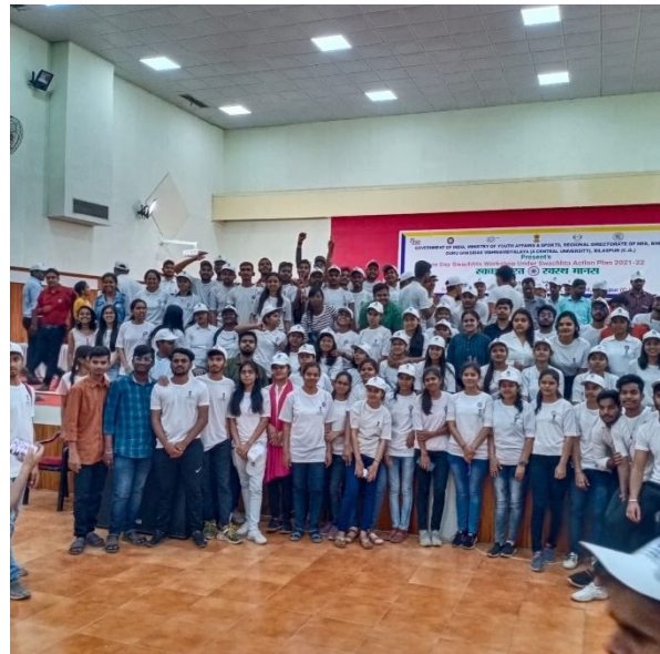
Workshop NSS, GGV