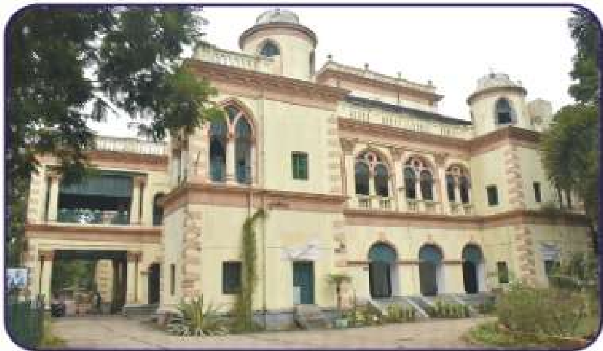
Gope Palace, the Administrative Building of Raja N.L. Khan Women's College (Autonomous)