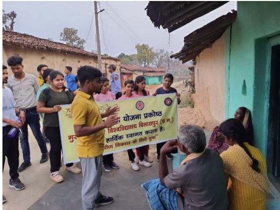
Interaction with tribal villagers-NSS, GGV

Phone No: 9179991817, Email Id: gitamishra007@gmail.com