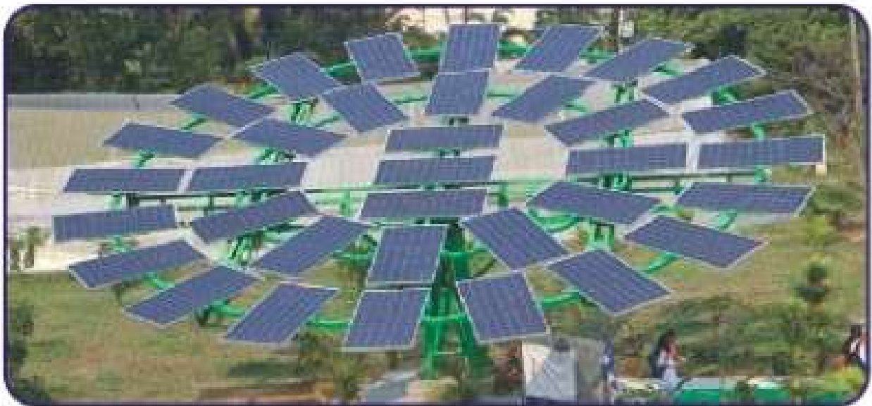
The Solar Tree installed at the campus of Raja N.L. Khan Women's College (Autonomous)