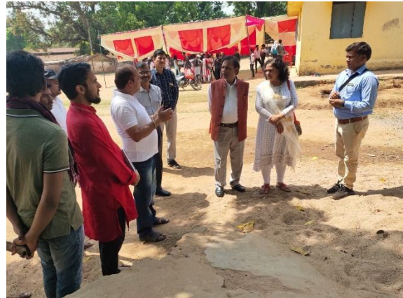
7-day camp visit by HVC GGV, NSS, GGV