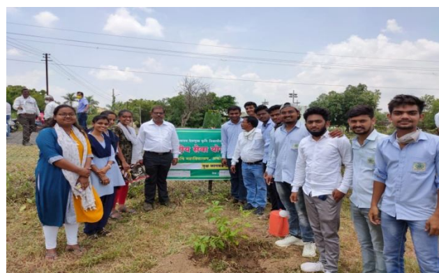
Tree Plantation Programme at College Premises- 01/07/2021