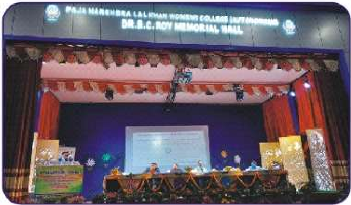
Dr. B.C. Roy Memorial Hall at Raja N.L. Khan Women's College (Autonomous)