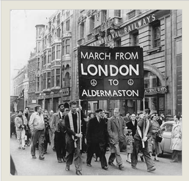
Figure 3. Aldermaston March, Easter 1958.

(p.194) The Easter weekend was particularly apt for such