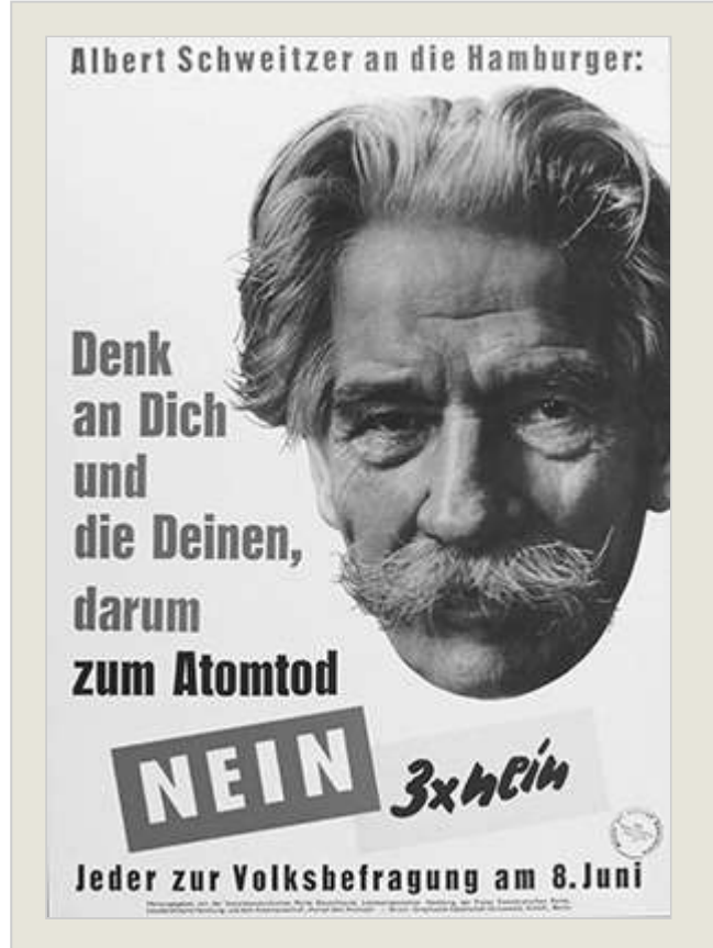
Figure 5. Poster, Campaign against Atomic Death, June 1958: 'Think about yourself and yours. Therefore: No to Atomic Death. Three times no!' (Courtesy

of death', an interpretation preferred by many Germans. 106 The CND symbol could be found on West German Easter Marches from 1961 onwards. It found its way onto flyers and pamphlets from about 1962 or 1963 onwards. 107 Similarly, the demonstrators in both countries would carry posters that were kept entirely in black and white to show the seriousness of the situation. <sup>108</sup> One activist criticized the choice of symbols. While he (p.211) drew attention to the importance of 'propaganda techniques' in order to win over 'the most primitive people', he regretted that 'our symbol is more about death than about life', while Hitler had chosen the 'positive sun wheel' to advertise his message. 109 The SPD-run campaign, concentrating primarily on mass meetings, had not developed its own symbol, but